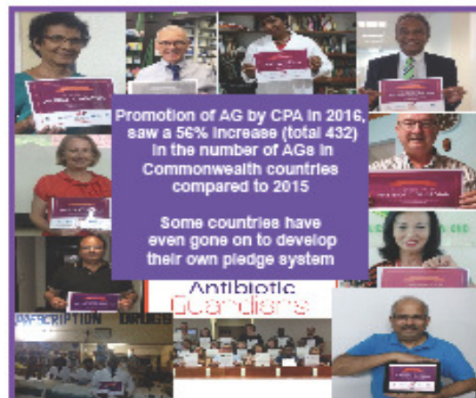
Figure 2: Some of the Antibiotic Guardians around the Commonwealth

The work that the CPA have carried out since 2016 has led to submission of abstracts and articles to raise awareness of AMR, as well as enabling the use of data to strengthen advocacy efforts at government level. A significant project to support pharmacist-led antimicrobial stewardship initiatives in 4 African nations in collaboration with another UK charity is currently being worked up. The CPA's WAAW 2018 Campaign is also under development.