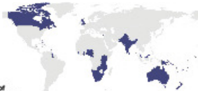
Figure 1: Location of Commonwealth countries

The CPA is a UK-based charity whose membership base consists of National Pharmacy Associations of the Commonwealth. As an affiliated organisation of the Commonwealth, the CPA has a key advocacy role for the profession at government level. The mission of the CPA is to help support the better use of medicines throughout the Commonwealth with a vision of improving the health and well being of the people of the Commonwealth.